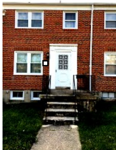
TYPICAL MIDDLE OF GROUP HOME 2 original design fluted pilasters and 1 plinth block on each side, standard crosshead with 6 fluted teeth. NO ACORN PEDIMENT.