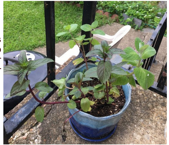
Mint loves to spread! Keep it in a container!