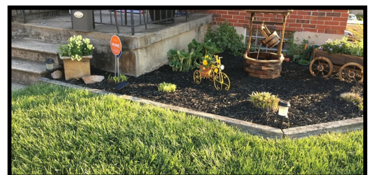
Springtime in Edmondson Heights

Tip for your azaleas: trim them soon after they finish flowering. They will use the summer months to develop blossoms for next spring!