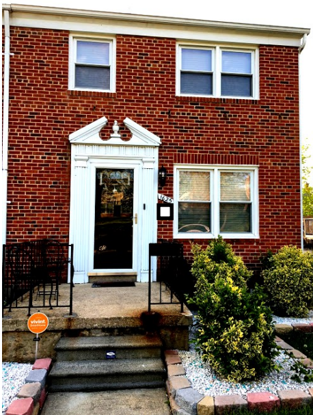
TYPICAL END OF GROUP HOME 2 original design fluted pilasters and 1 plinth block on each side, Acorn pediment, standard crosshead with 6 fluted teeth

Boundaries of Edmondson Heights are as follows: 1100 thru 1248 Newfield Road, 1000 thru 1235 Harwall Road, 1101 thru 1197 Granville Road, 1400 thru 1654 Forest Park Avenue, 1080 thru 1196 St Agnes Lane (Even Side Only), 1000 thru 1012 Sanbourne Road, 1437 thru 1531 Ingleside Avenue (Odd Side Only), 1400 thru 1561 Clairidge Road, 1400 thru 1561 Barrett Road, 1400 thru 1655 Kirkwood Road, 1400 thru 1659 Langford Road.