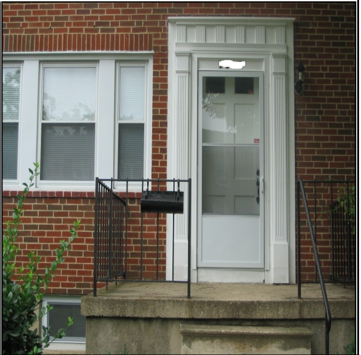
TYPICAL End of Group Covenant Compliant Home Front Entrance Door Trim Two Original Design Fluted Pilasters and One Plinth Block on each side, Acorn Pediment, Standard Crosshead with 6 Fluted Teeth.